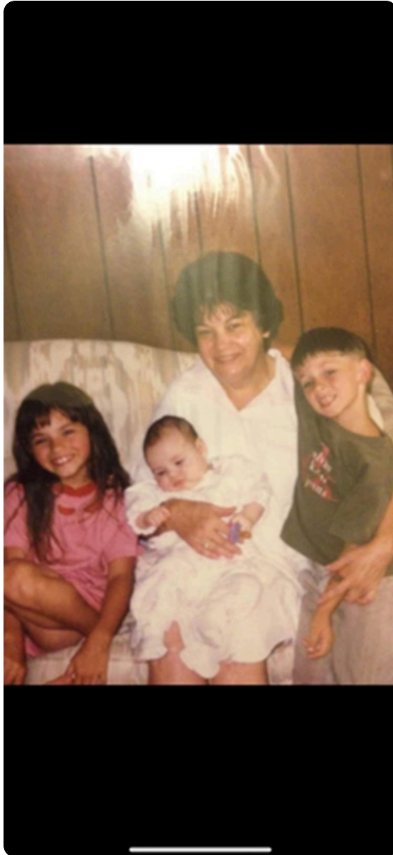
Our Mamaw , If roses grow in heaven lord please pick a bunch for us place them in our families...

Schneider-Hall Funeral Home shared 4 photos to the Obituary Wall November 20 at 1:08 PM album.